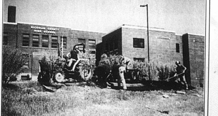
Members of FFA work on the new bus loop at Nicholas County High School.

Have you been wanting to get started on that summer planting? If so than the Nicholas County High School Students Future Farmers of America (FFA) members and other students have been working hard over the past few months, to provide citizens of Nicholas County and Carlisle with quality annuals, perennials, and vegetable plants.