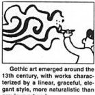
Gothic arch emerged around the 13th century, with works characterized by a linear, graceful, elegant style, more naturalistic than previous artwork.