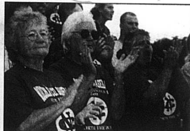
Several hundred Nicholas County baseball fans packed Cliff Hagen Stadium in Lexington during last week's High School Baseball State Tournament. The Bluejackets ended their Cinderella season with a 5-2 loss to eventual state champion Henderson County.