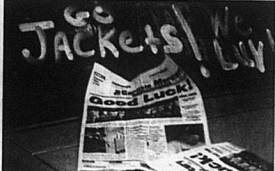
Community support was overwhelming in Lexington!