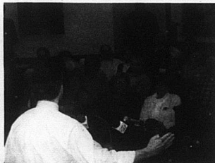
Fletcher discussing his role in helping folks throughout Central Kentucky during the 106th Congress.