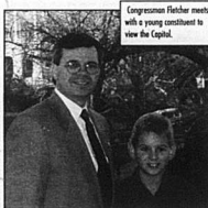
Congressman Fletcher meets with a young constituent to view the Capitol.

WORKING TO PROVIDE THE NECESSARY FUNDS TO ASSURE THAT EVERY POLICE OFFICER THAT NEEDS A BULLETPROOF VEST IN CENTRAL KENTUCKY AND AMERICA WILL RECEIVE ONE.