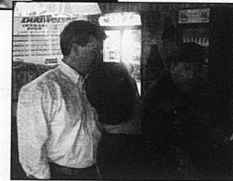
Below: Discussing the problems facing folks throughout the 6th Congressional District

"For the past several weeks, Republicans and Democrats have been working together to ensure that patients get the quality health care they need - when they need it. I am pleased that we have reached a major bi-partisan breakthrough."