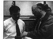
Left: Talking with a constituent during a Clark County Town Hall meeting

"It is an honor for me to be a part of this House/Senate Conference Committee on health care legislation. As a family physician, I took an oath to work to the best of my ability to help people overcome illness and injury. This oath applies whether or not I am in a hospital or seeing a patient—it is a moral commitment to help people in need. This same obligation will guide my actions in this conference. We must address not only the quality of care provided by insurance plans, but also the accessibility of these plans to all Americans."