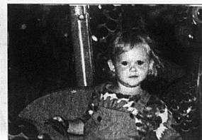
Nicholas County residents enjoyed this year's Blackberry Festival. The festival had one of it's largest crowds ever. You can tell by this little ones face that it sure was a lot of fun.