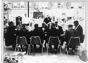
Members of the Nicholas County Fiscal Court dressed up in attire from 200 years ago during the Bicentennial Celebration held on the courthouse lawn this past Saturday.