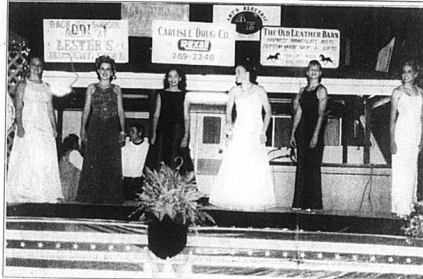
2000 Nicholas County Fair Court