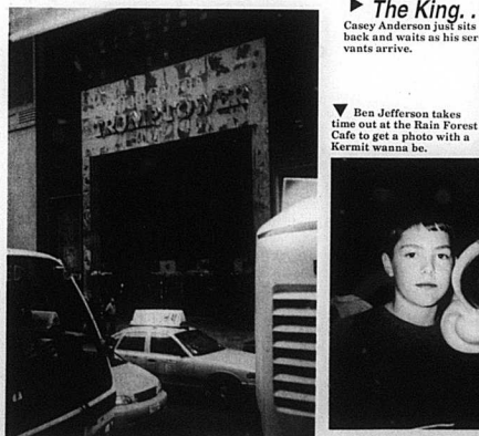
Rags to Riches