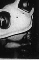
Stand up and cheer... The Little League Hawks get the crowd going with this pyramid.