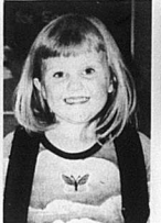
"Going to Mama's." Hannah McFord Kindergarten