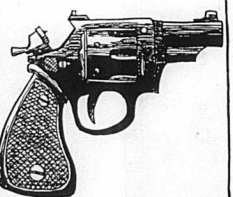
WHICH HAS BEEN RECALLED FOR BEING A DANGER TO YOUNG CHILDREN?