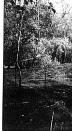
Continued from page 1