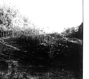
A wildfire on Beaver Creek Farm outside Carlisle, destroyed about 3 acres of land. The fire which lasted about 10 hours was managed by the Nicholas County Fire Department and the Kentucky Division of Forestry.

Governor Paul Patton is scheduled to be the featured speaker in dedication ceremonies for the new lodge at the Blue Licks Battlefield State Resort. Park in Robertson County. The event is slated for 9:30 a.m. on Thursday, October 7, 1999. The lodge is developed in stages. A 16 room complex opened in May and a second addition with the same number of guest rooms will be completed by year's end. Blue Licks becomes the 17th resort in the Kentucky State Park System.