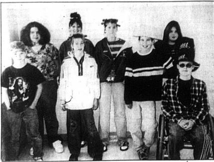
This week at Nicholas County Elementary School students while be acting a little strange. The students in these pictures are showing just a few of the daily activities that are going on for "Hat and Bad Hair Day!"