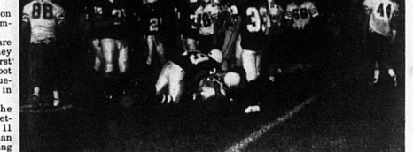
The Lions put up a good fight, but the Bluejackets showed what it takes to be a winner. The Bluejackets remain undefeated.

Lions, they were undefeated and wished to remain that way. The Bluejackets played