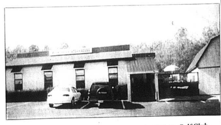
Ladobee's is located on U.S. 68 across from the Carnico Golf Club.