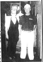
Employees welcome you

Ladobee's is open Wednesday and Thursday between the hours of 4:00 p.m. and 10:30 p.m. and Friday and Saturday, between 11:00 a.m. and 10:30 p.m. From intimate dinners to family reunions just give Ladobee's a call at 606-289-4800. Reservations are not needed to enjoy an evening of good food.