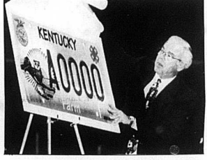
Governor Paul Patton unveils the new license plate which is dedicated to Future Farmers at the FFA National Convention in Louisville.

"We redesigned the plate in recognition of the FFA moving their national convention to Kentucky and to honor our future leaders in Kentucky and around the nation. We also included the 4-H logo to honor that great organization as well," Governor Patton said as he addressed members of the organization at their national convention at Freedom Hall on Thursday. "We chose to unveil this new plate here today to show you that we're happy to have you here, and we look forward to all the future national FFA conventions," the governor added. The FFA has selected Louisville as the site for its national convention for the next six years.