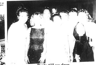
Party till we drop. These students at the Nicholas County High School Senior prom took a time out from dancing to pose for this photo.