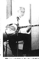
These picking fools of "Live Longer and Like It Band" having a little showdown on the banjo and electric guitar.

Other activities scheduled this week included a memorial service for friends of JMHC