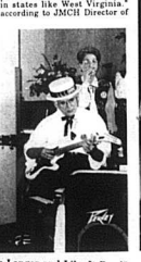
These member of the "Live Longer and Like It Band" members performing their rendition of "A Bicycle Built for Two." The couple has been married for over 50 years.

who have gone on in the past year and will finish with a balloon lift-off at 1:30 p.m. outside the Health Care Center. In the past balloons have been received in states like West Virginia according to JMHC Director of