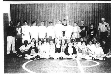
Members of the 1999 Nicholas County Middle School track team.