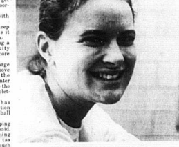
Student of the Week

"You don't have to file an application to receive these payments," said Cole. "They were automatically paid to eligible farmers."