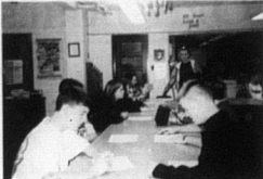
Students prepare for ASVAB testing Tuesday, March 24.