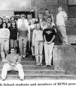
Nicholas County High School students and members of KUNA posed for a shot as they talked about their exciting trip to Louisville recently.