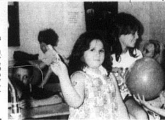
Students experiment with static electricity and other phenomena of science during the 6th Annual Nicholas County Kid's College, held June 8-12 at the high school.