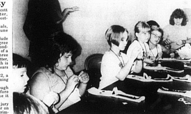
Students in the "Duck" age group make Donkey Sock Puppets during the Kid's Crusade at the Carlisle Assembly of God church, July 24 and 25.

Organizers of the event stated that a good crowd was in attendance for both days of the Crusade.