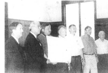
Governor Paul Patton presented a check for $50,000 to the Industrial Authority during his visit at the Nicholas County Courthouse Monday, July 27.

Governor Paul Patton presented a check for $400,000 to Carlisle and Nicholas County for the purpose of building a new health center during his visit Monday, July 27.