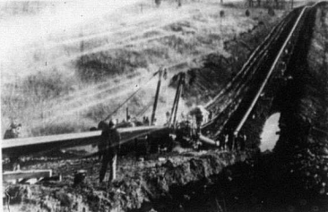
Remember when The Columbia gas line serves Carlisle and goes on to the Cincinnati area. Do you remember when it was installed? Do you recognize anyone in the photo? Call The Mercury at 299-2464.