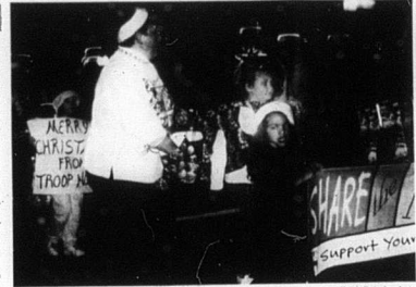
Parading along Nicholas County Girl Scouts marched in Friday night's Christmas parade in downtown Carlisle.