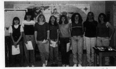
The Nicholas County Lady Jackets Junior Varsity team poses with their awards Friday, April 24, at the annual banquet.