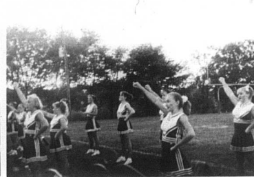
NCHS cheerleaders got everybody in the mood for an exciting game last Friday