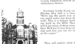
The courthouse flag will once again take its place in front facing Main Street.