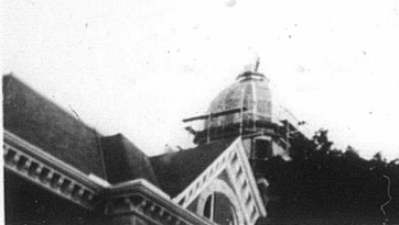
James Abel stands atop the dome as he positions the hatch covering.