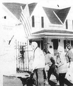
Citizens made their way up the hill to the cemetery for the continuation of the veterans service.