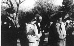
Flags and more American flags were distributed Sunday, in honor of Veterans' Day. Many were in uniform.