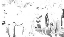
All ages turned out to honor veterans in the service.