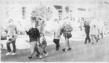
A crowd made its way to the cemetery, walking quietly down Main Street.