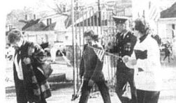
Several more Nicholas County residents entered the cemetery gates to conclude the Veterans' service.