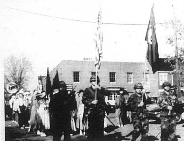
Members of the National Guard, Carlisle, led the parade to the cemetery.