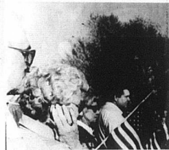
The 21-gun salute was loud and long. One veteran was overheard he'd been in battle "when it was real."