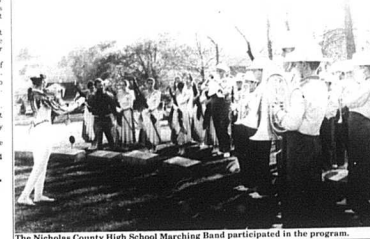
The Nicholas County High School Marching Band participated in the program.