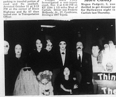
Bank has Halloween fun

Employees of Whittaker Bank, Carlisle, celebrated Halloween last week by dressing up in costume.