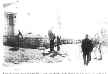
Kentucky State Police from the Dry Ridge Post stood outside Sharon Young's residence at 2245 East Union Road, Carlisle, after she was killed by a gunshot blast early Tuesday morning.