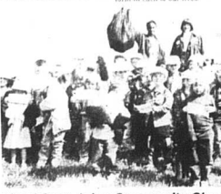
Head Start Joins Community Cleanup

All friends and family wish them health and happiness.