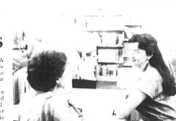
Special visitor Barbara Kinsglover, right, Carlisle native and worldwide author of popular novels such as Bean Trees, was a special guest at a reception last Friday at the Nicholas County Library.