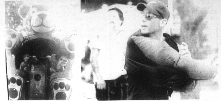
Blackberry Festival Bears were a hit with youngsters despite Monday night's rain. Throw the ball and maybe you'll get a prize! Everyone's sure to be a winner at the Blackberry Festival.