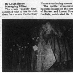
Toddler girl dresses are ready for shipment.