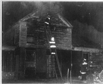
Fire destroys house Tuesday night