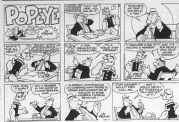
R.F.D.