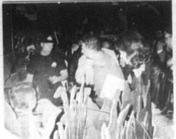
Movie Actor Jean Claude Van Damme promoted his film movie, Double Team, at Planet Hollywood in Chicago April 7 as selected Nicholas County Elementary honor student, watched.