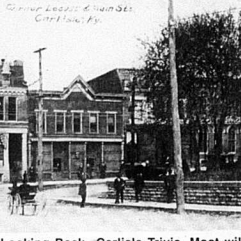
Carlisle Mercury building.