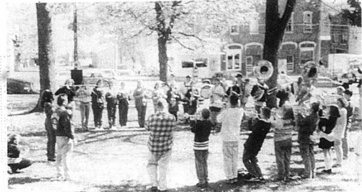
The Nicholas County Marching Bluejackets' orchestra perform upon the arrival of Governor Paul Patton on Thursday, October 24.