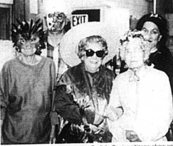
Members and one worker from the Carlisle Senior citizens show us how scary they can really be!