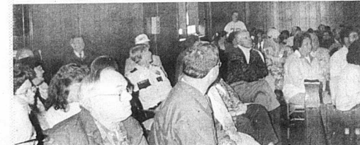
The crowd listens at a town meeting, with guest speaker, Governor Paul Patton on Thursday, October 24.