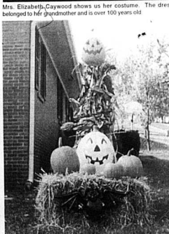
This yard on Cardinal Lane in Carlisle has the spirit of the season.