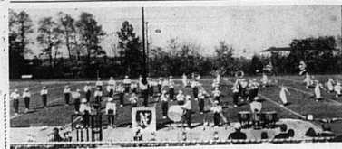
The Nicholas County Band in competition Saturday, Oct. 9