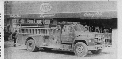
Firetrucks were dispatched to the scene of a possible electrical fire at Carlisle IGA on Monday.