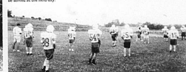
The NCHS Varsity and Jr. Varsity Bluejackets recently began practicing for the upcoming football season.

Along with sidewalk repairs, the interior of the Carlisle Post Office is currently being installed with items such as, new lighting, and new security doors. The repairs will take about one month to complete.