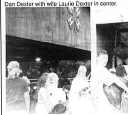
On Friday, July 19 campers at the North Central 4-H Center packed up to head back home after spending an exciting week with campers from Nicholas and surrounding counties.