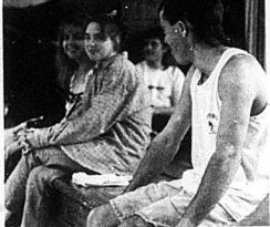
Boarding a bus to go home Tuesday afternoon, these Nicholas County students enjoyed getting together following the holidays.

The Turing, a large group of nomads who live in the Sahara, are often called the Blue Men of the Desert, because they wear indigo-dyed robes which leave a blue color on their skin.