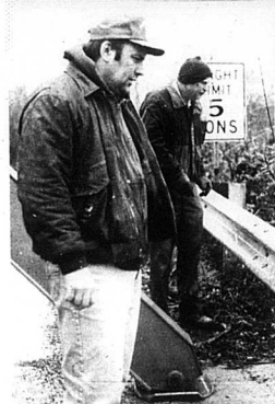
The Licking River looked muddy in the background at Isham's Chapel as the pump was lifted from the water.