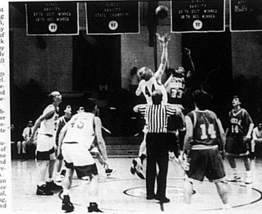
Jackets reach high in tip off against Sayre Friday night at home.