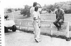
Carnico golfers wait to tee off.