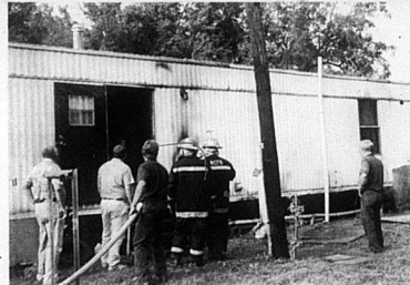
Nicholas County Volunteer Firemen responded to a mobile home fire on Crooked Creek on Thursday, August 22.