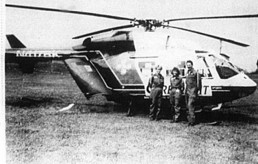
The Care Flight getting ready to give lessons to Nicholas county Nurses and EMT's.