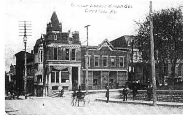
Looking back..... Carlisle Trivia. Most will know where, but do you know when this photo was taken? Call in your guess to the Carlisle Mercury office and receive a discount on a on year subscription.