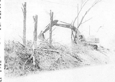
Making a safer way. Hinkle Contracting began work on the project to make the intersection of Concrete Road and Miller Station Road less dangerous. The project is expected to take 180 days of work to complete.