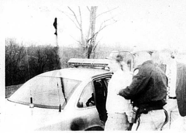
This suspect was awakened early Friday morning by state police executing an arrest warrant for drug charges.

Parents of children at Nicholas County Head Start will be seeking pledges for St. Jude Hospital during the program.