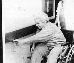
The one who gets the most eggs wins! This JMC resident had a great time looking for and grabbing Easter eggs made of construction paper at the nursing home on Friday.

human water needs, including drinking water and industrial uses. Americans draw about 420 billion gallons of water per day from ground and surface water supplies, but most of that is used for irrigation and industrial use. About 30 billion gallons per day, or 130 gallons per person each day, is treated and delivered for public use. Here in Kentucky, each person uses an average of 68 gallons of water each day. Here are some other interesting tid-bits about water use: "One-fourth of our nation's recreational activities are water based." "The average person will drink close to 16,000 gallons of water in a lifetime." "About 81% of fresh water supplies are used for irrigation purposes." "It takes about 120 gallons of water to produce an egg." "An average toilet flush uses 5 to 7 gallons of water per flush."